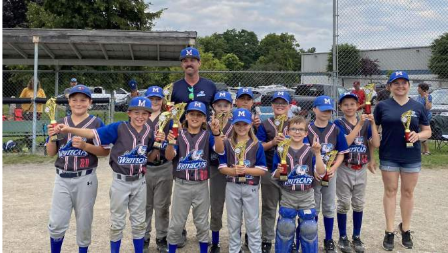
Minor Dark Gray, D2 Minor A-Side Champions

The Minor teams took 1st and 2nd place (out of 17) in the D2 standings. One of the Minor teams won the D2 playoffs and took home the A-side Championship title.