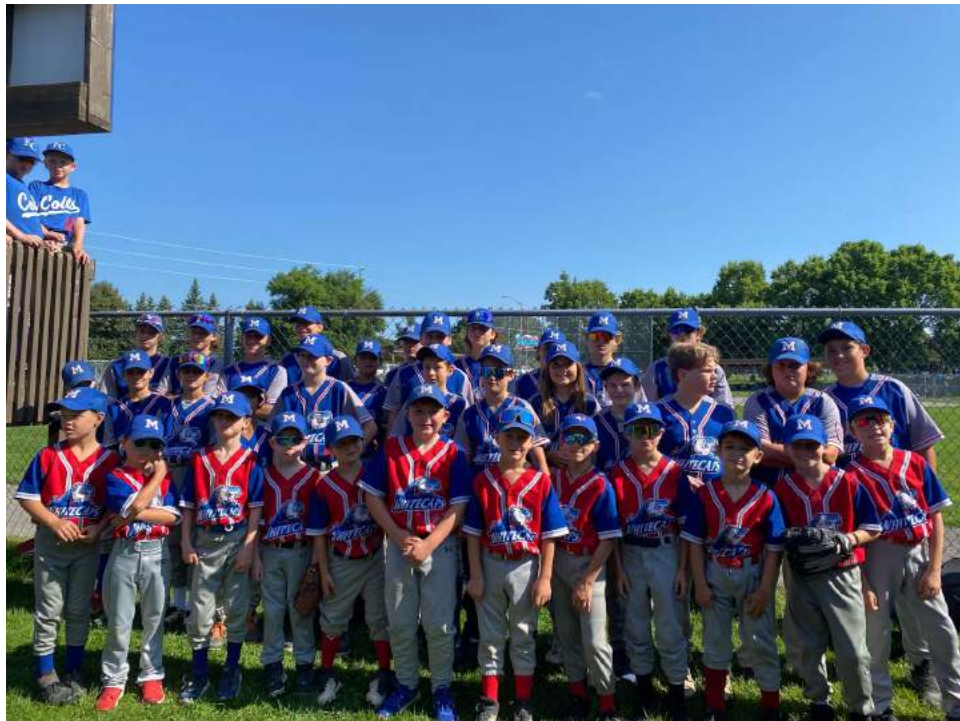
Major Blue and Rookie Canadian at the Scott Tokessy Tournament, August 2023