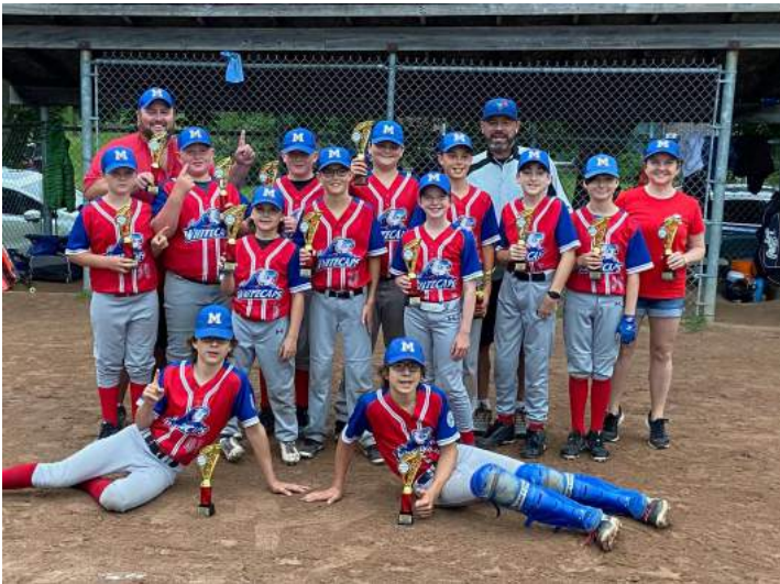
Major Red, D2 Major A-Side Champions

Both Major teams won their D2 division Playoff Finals (A-side and B-side).