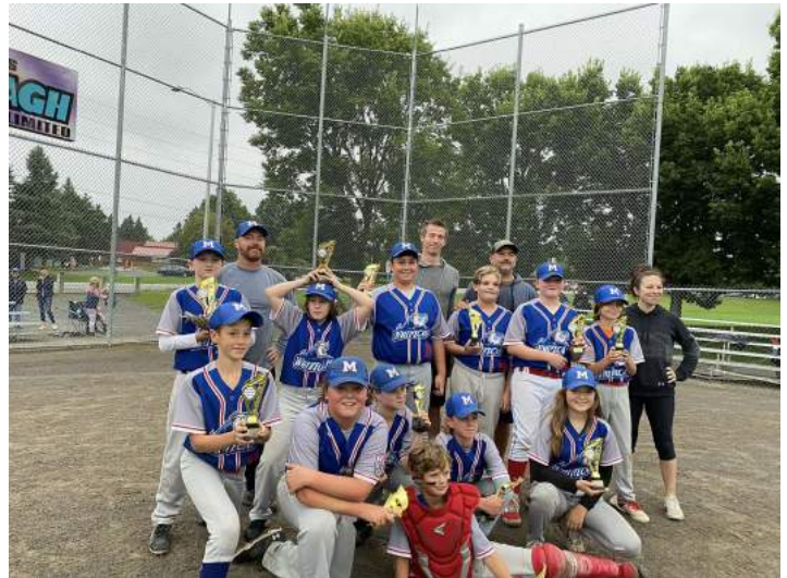
Major Blue, D2 Major B-Side Champions